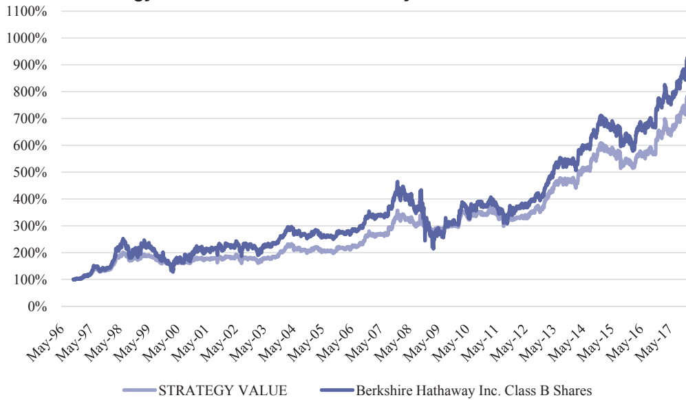
Chart 1: Strategy Value vs Berkshire Hathaway Inc. Class B Shares

Investors should note that past performance is not a reliable indicator of future performance. Future volatility and returns may vary.