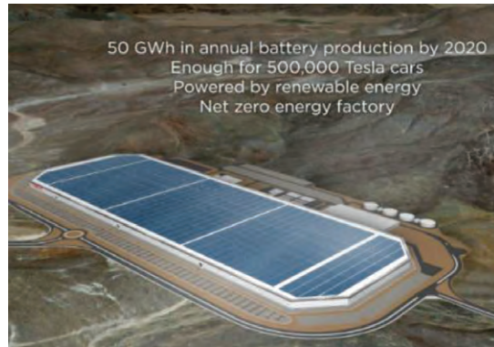
Tesla's Gigafactory in Nevada.

Tesla is targeting 500,000 Electric Vehicle units of annual production by 2018, 2 years earlier than previously planned. Management also suggested that they hope to sustain a 50% growth rate, which would imply 1+ million units by 2020.