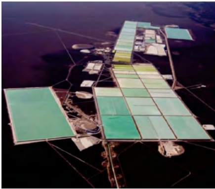
Albermale's Salar de Atacama operation in Chile.