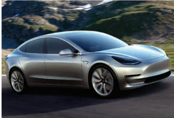
The Tesla Model 3. Tesla's affordable, mass market car with first deliveries due in late 2017 or early 2018

Tesla is a US based company active in the automobile and energy storage sectors which designs, manufactures and sells electric vehicles and electric vehicle components. Founded by its CEO and Chairman Elon Musk, the company is an innovation leader in the field of energy storage application (electric vehicles, power banks). The company is listed on the NASDAQ stock exchange (NASDAQ:TSLA).