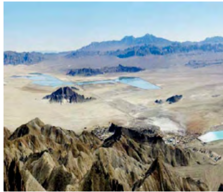
Albermale's Silver Peak Salar operation in Nevada, U.S.. Salars (Brines) are salt lakes, where Lithium is mined using evaporation processes.