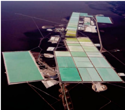
Albermale's Salar de Atacama operation in Chile.