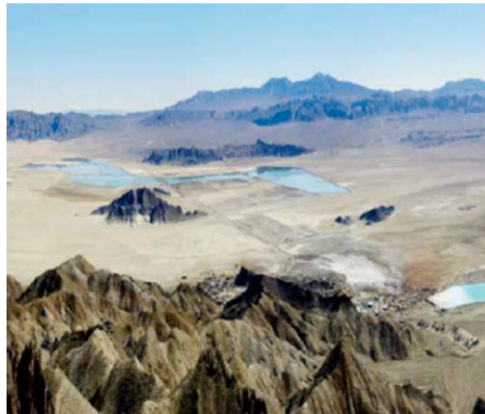
Albermale's Silver Peak Salar operation in Nevada, U.S.. Salars (Brines) are salt lakes, where Lithium is mined using evaporation processes.