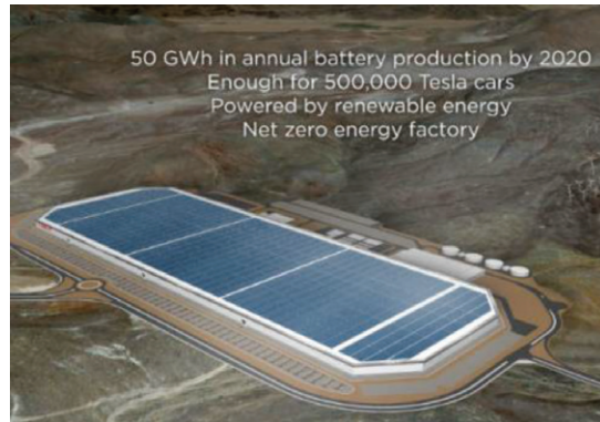
Tesla's Gigafactory in Nevada.

Tesla is targeting 500,000 Electric Vehicle units of annual production by 2018, 2 years earlier than previously planned. Management also suggested that they hope to sustain a 50% growth rate, which would imply 1+ million units by 2020.