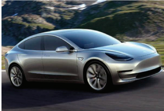
The Tesla Model 3. Tesla's affordable, mass market car with first deliveries due in late 2017 or early 2018

Tesla is a US based company active in the automobile and energy storage sectors which designs, manufactures and sells electric vehicles and electric vehicle components. Founded by its CEO and Chairman Elon Musk, the company is an innovation leader in the field of energy storage application (electric vehicles, power banks). The company is listed on the NASDAQ stock exchange (NASDAQ:TSLA).