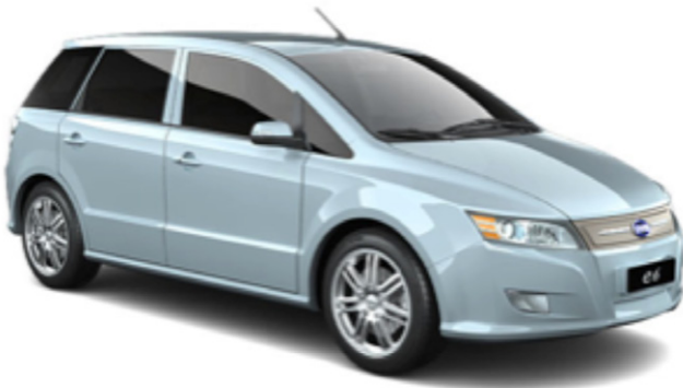
BYD e6 electric vehicle

BYD Company Limited (BYD) was officially founded in 1995 and was listed on the Hong Kong Stock Exchange in 2002. Currently, BYD is principally engaged in 1) automobile business, which includes traditional fuel-driven vehicles and new energy vehicles (NEV); 2) handset components and assembly services business; and 3) rechargeable battery and photovoltaic business.